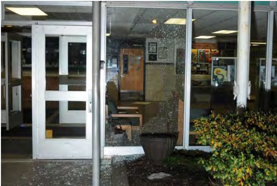
Entrance into Sandy Hook Elementary